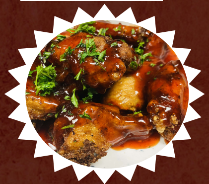
Alitas De Pollo Chicken Wings (4) Tossed w/ Chili Sweet Sauce