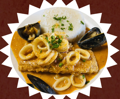
Crispy White Fish Fillet

Peruvian Style Cilantro Rice Tossed w/ Shrimp & Coleslaw Salad