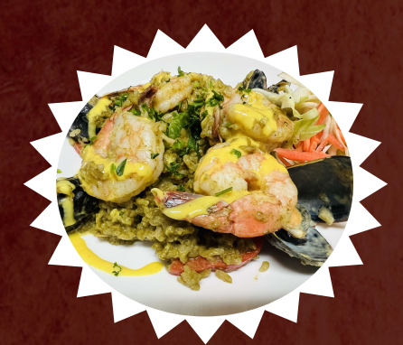
Cilantro Rice w/ Shrimp & Mussels Peruvian Style Cilantro Ri

Peruvian Style Cilantro Rice Tossed w/ Shrimp & Coleslaw Salad