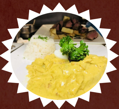
Aji De Gallina Peruvian Creamed Chicken

Topped w/ Calamari, Mussels tomato Creamy Sauce &