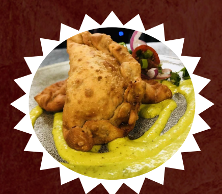
Peruvian Fried Empanadas (2) Steak, Chicken or Chorizo